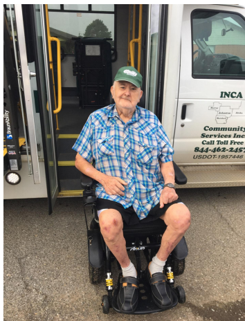
Norman Thomas 80 years old